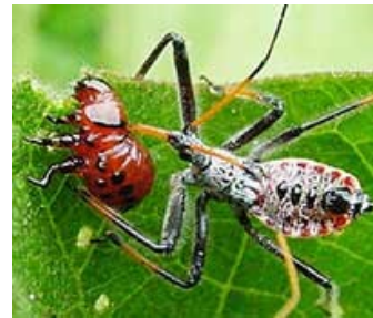
Assassin Bug on Potato Beetle

..... You might also be interested in Natural Enemies (Wisconsin Vegetable Entomology) a brief publication featuring Wisconsin beneficial insects.