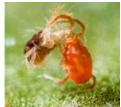
Arachnid predatory mite-spidex