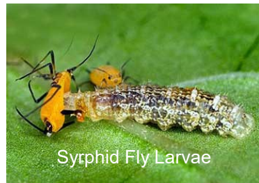
Syrphid Fly Larvae