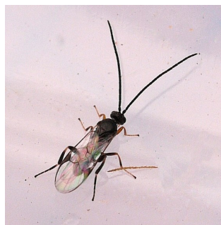
Predatory Cotesia Wasp